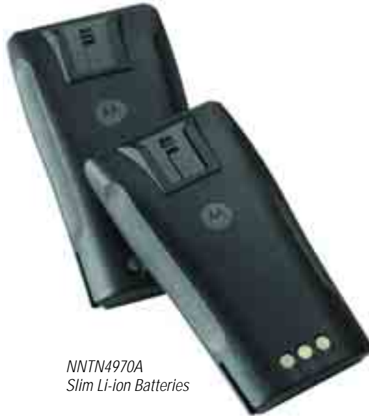
NNTN4970A Slim Li-ion Batteries

NNTN4970A – 1600 mAh Slim Li-ion Battery