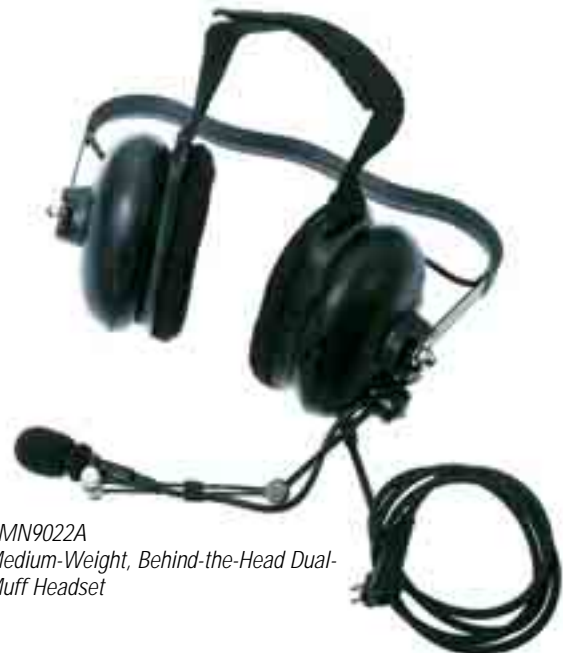
HMN9022A Medium-Weight, Behind-the-Head Dual-Muff Headset