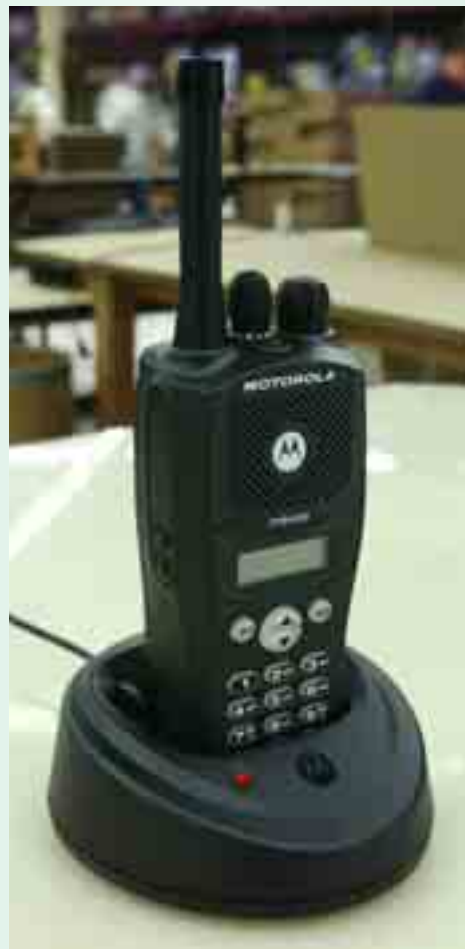
WPLN4138AR Desktop Rapid 90-Minute Charger

(For use with NNTN4496AR NiCd battery only.)