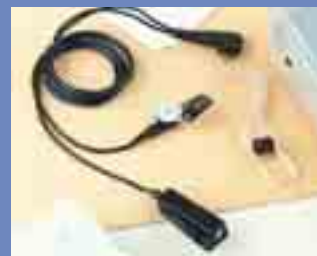
RLN5318A – Black Two-Wire Comfort Earpiece with Combined Microphone and PTT