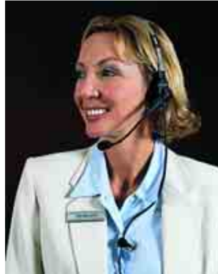
HMN9013A Lightweight Single-Muff Headset

Behind-the-head style can be conveniently worn with most hard hats. Noise-reduction rating of 24dB. High-clarity sound with the additional hearing protection necessary for providing virtually constant, clear radio communication in harsh, noisy situations.