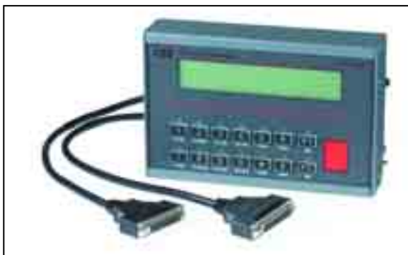
RDN7368A Mobile Display Terminal