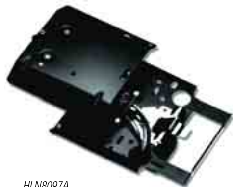
HLN8097A Removable Slide Mount