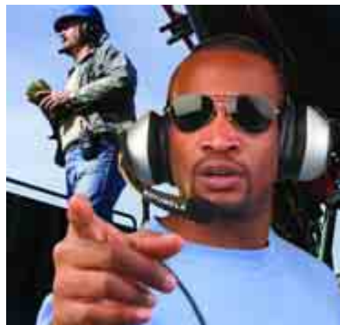
RMN5015A Racing Headset