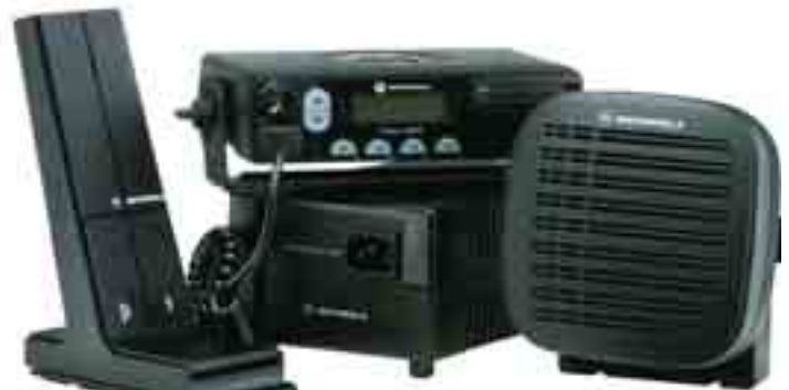
HSN8145B External 7.5-Watt Speaker