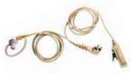
HMN9754D – Beige Earpiece Assembly with Microphone and Combined Push-to-Talk

Two-wire accessory allows users to transmit and receive discreetly.