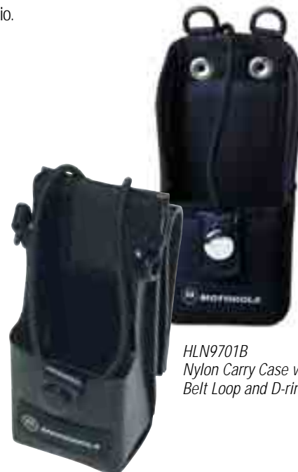
HLN9701B Nylon Carry Case with Belt Loop and D-rings