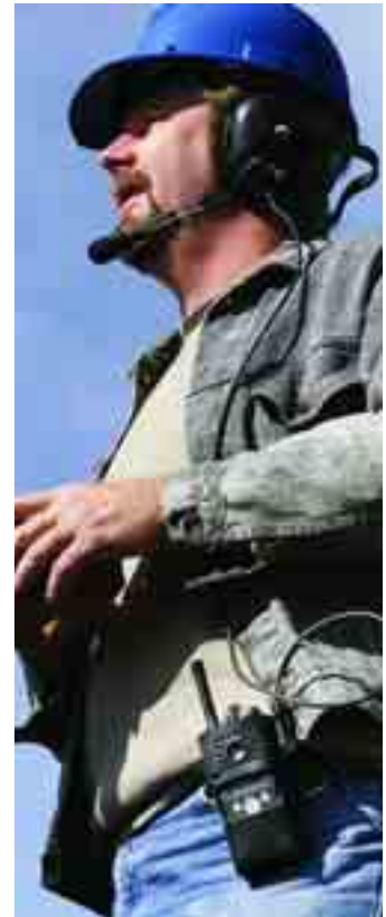
RLN5641A Hard Leather Carry Case with 2.5-Inch Belt Loop

Attaches to D-rings on carry cases to provide added comfort.