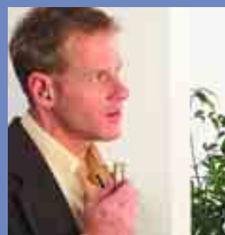
RLN5317A – Beige Two-Wire Comfort Earpiece with Combined Microphone and PTT