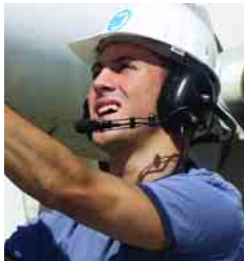
HMN9021A Medium-Weight Dual-Muff Headset

For use with PR400 two-way radio and RMN5015A Racing Headset.