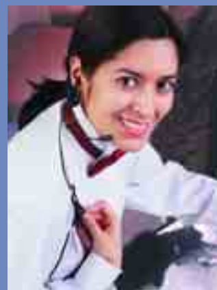
PMMN4001A Ultra-Light Earpiece with Microphone and In-line PTT