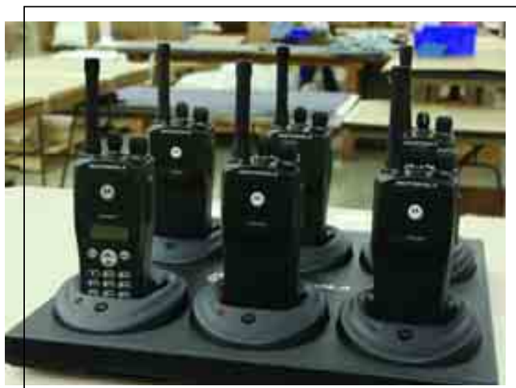
WPLN4161AR 6-Unit Rapid-Rate Charger