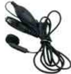
HMN9036A Earbud with Microphone and Push-to-Talk

Pellet-style earpieces allow users to communicate discreetly and are comfortable for extended periods of time. Clip microphones securely attach to shirt.