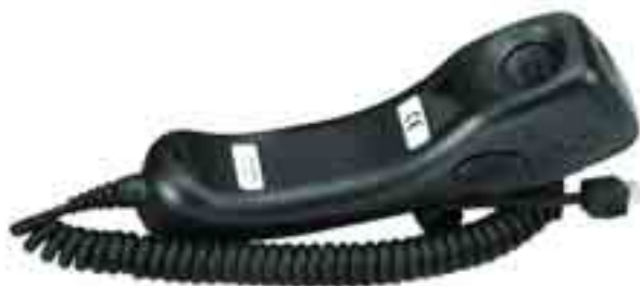
AAREX4617A Telephone-Style Handset