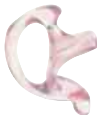
RLN4763A Custom Clear Comfortable Earpiece

Designed to form to the inside of the ear; perfect for low-noise environments. Made of easy-to-clean, chemically-inert hypoallergenic material. Requires NTN8371A Clear Acoustic Tube Assembly and a Motorola Surveillance Kit for operation.