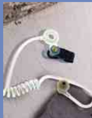
NTN8371A Low-Noise Kit