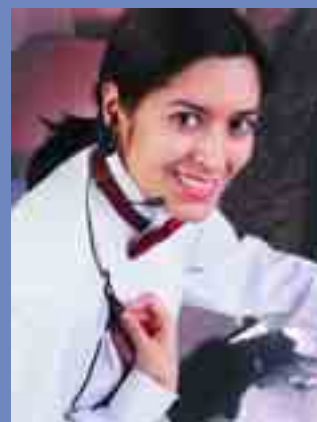
PMMN4001A Ultra-Light Earpiece with Microphone and In-line PTT