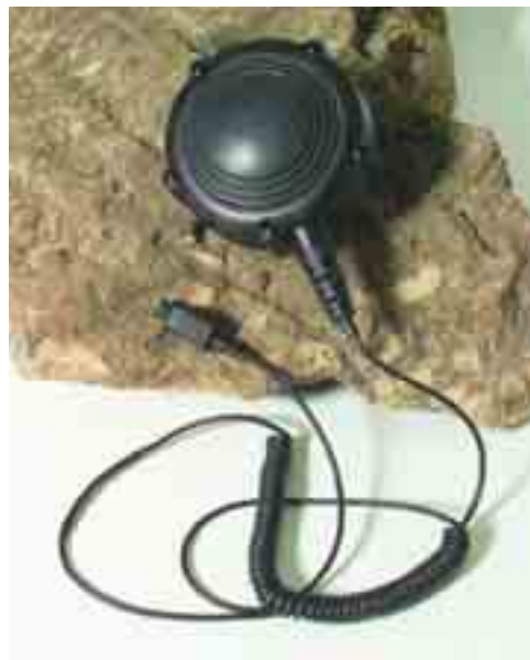
0180300E83 Body Switch Push-to-Talk