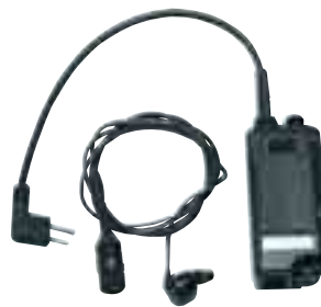
BDN6646C Ear Microphone System, with PTT Interface