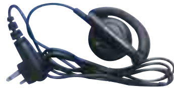
BDN6720A – Black Flexible Ear Receiver

Receive-only earpieces contain a flexible ear loop and speaker worn on the outside of the ear.