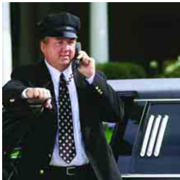
Telephone-Style Handset is ideal for users wanting to conduct private conversations.

Compatible with all Motorola microphones. No installation required.