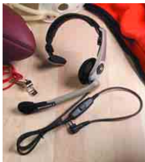
RLN5238A NFL®-Style Lightweight, Single-Muff Headset with In-line Push-to-Talk