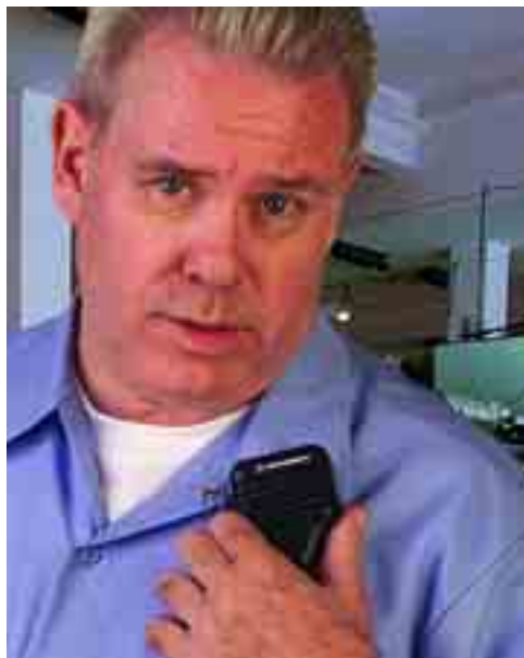
HMN9030A Remote Speaker Microphone

RLN5500A – Accessory Retainer Clip Holds audio accessories securely to radio.