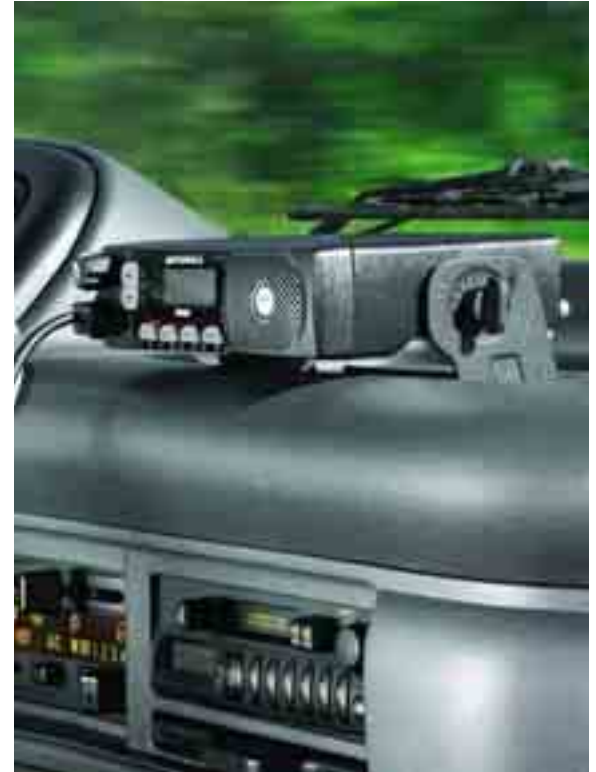
GLN7317A High-Profile Mounting Bracket

Removable slide mount is ideal if users frequently move the radio from one vehicle to another. The radio easily slips in and out of the slide mount so users can take it with them when they leave the vehicle.