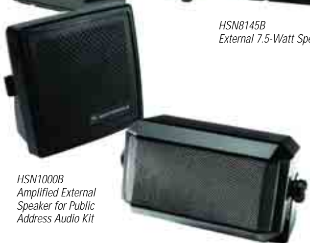
HSN1000B Amplified External Speaker for Public Address Audio Kit