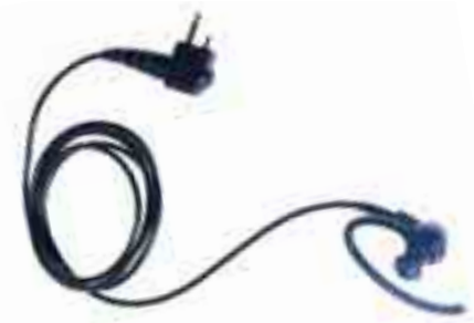
RLN4894A Black Receive-Only Earpiece

Allows user to privately receive communication; ideal when discreet communication is important.