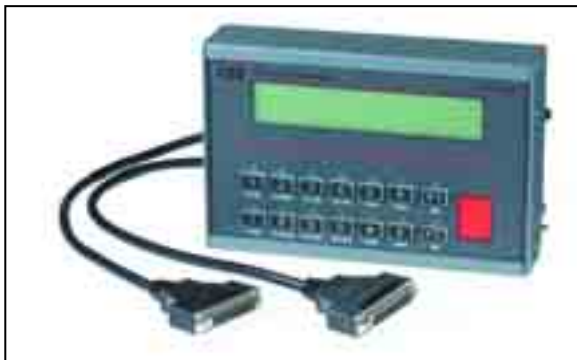
RDN7368A Mobile Display Terminal