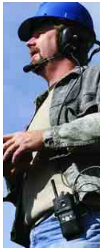
RLN5641A Hard Leather Carry Case with 2.5-Inch Belt Loop

Attaches to D-rings on carry cases to provide added comfort.