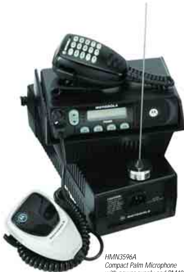
HMN1035C Heavy-Duty Palm Microphone